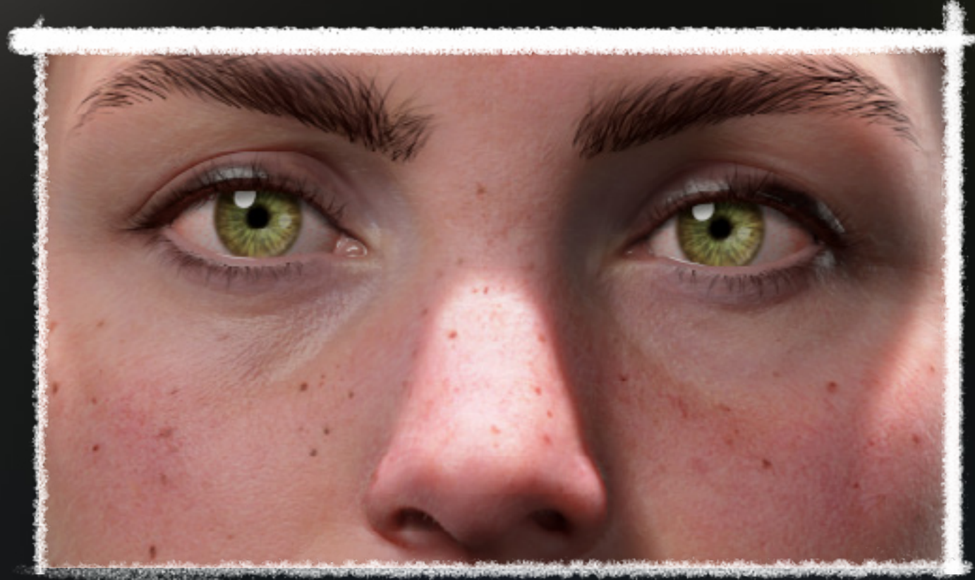
Green eyes and freckles