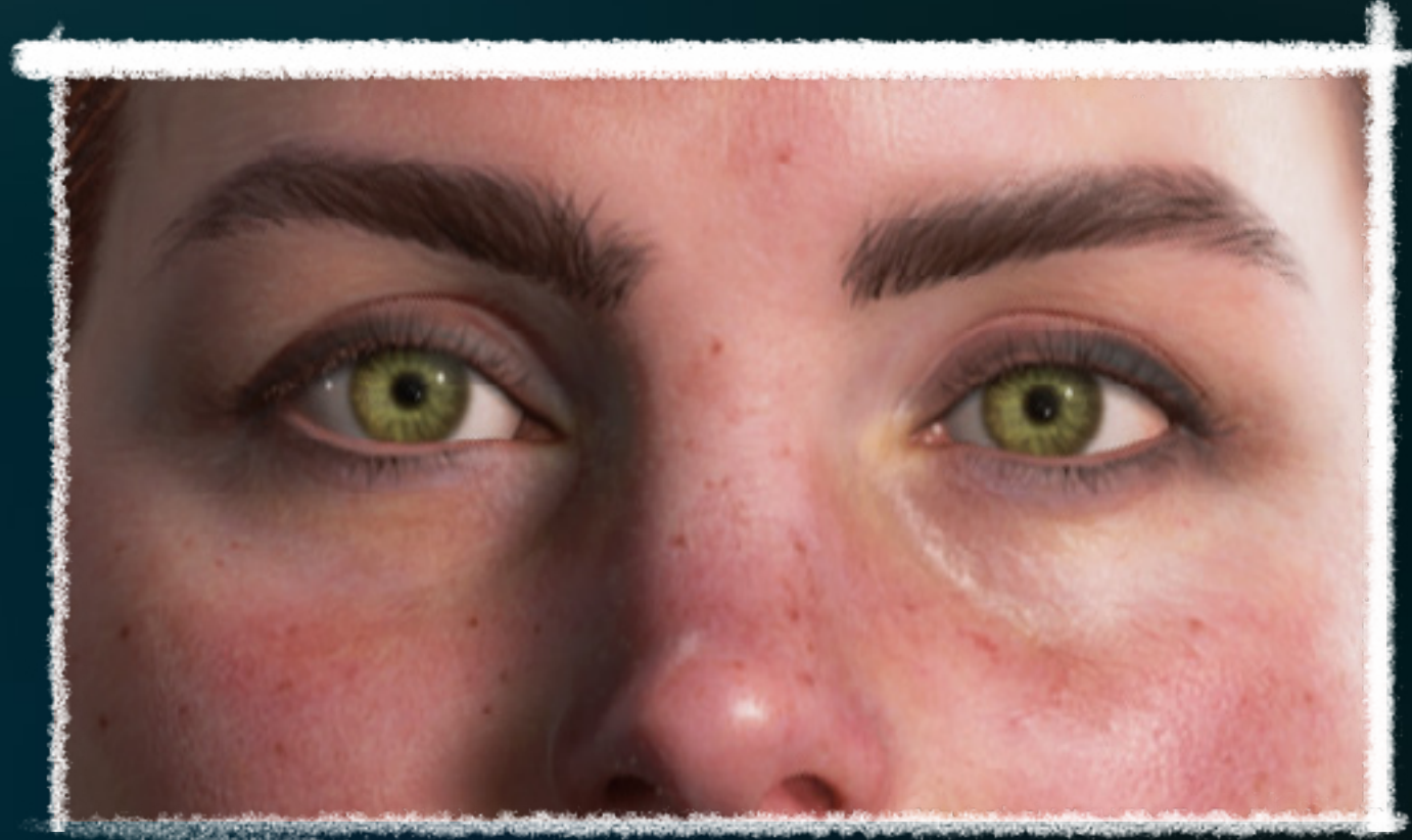
Green eyes and freckles